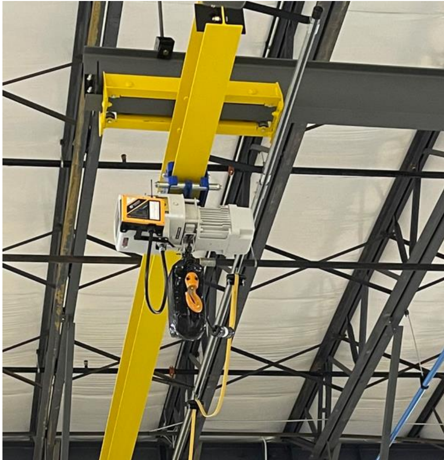
2.2.1 SBK End Truck Part of a Crane System