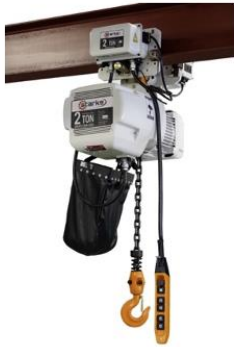
Hoists & Trolleys

Contact Your Starke Representative for More Information on Products to Help Maximize Your Workplace Efficiency