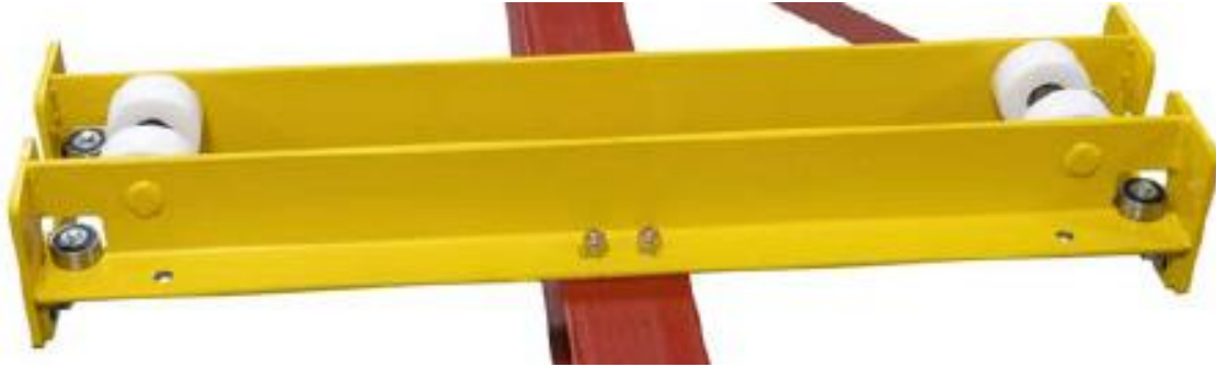
1.1 SBK End Truck

Thank you for purchasing a Starke SBK Under Running Manual End Truck Kit. These HD bridge crane end trucks require very little maintenance and can accommodate most lengths of bridge cranes. These simple yet durable units are built in the USA and have been a proven success for many, many years.